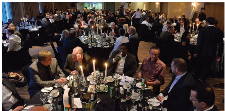
Confex offers opportunities to build business outside the usual working environment.